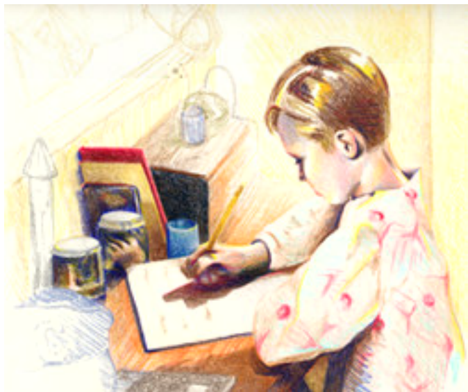
Illustration © Danlyn Iantorno